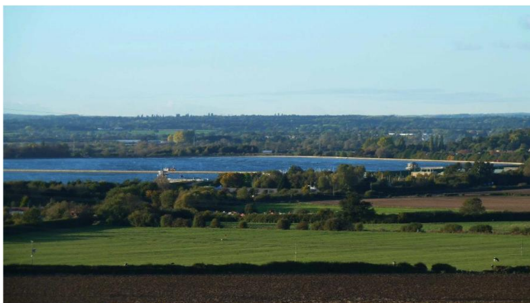
View 16 From Denman's Farm across Farmoor valley to Reservoir.

Additional Evidence: The north facing slopes have wide views north over the Thames Vale, including Farmoor reservoir, as well views of rising ground including wooded Wytham Hill on the horizon to the north. In its recommendation to plan, manage and protect distinctiveness, actions should be taken to 'preserve the important panoramic views to Wytham Woods to the north'.