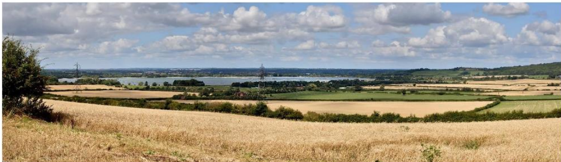
View 3 From Denman's Copse across Farmoor valley to Reservoir and Cotswold Hills.

Additional Evidence: The north facing slopes have wide views over the Thames Vale, including Farmoor reservoir, as well as views of rising ground including wooded Wytham Hill on the horizon to the north. There are panoramic views north from the B4017 which is nearby. Cumnor NP landscape Character assessment LCA 12 Para 12.5.2